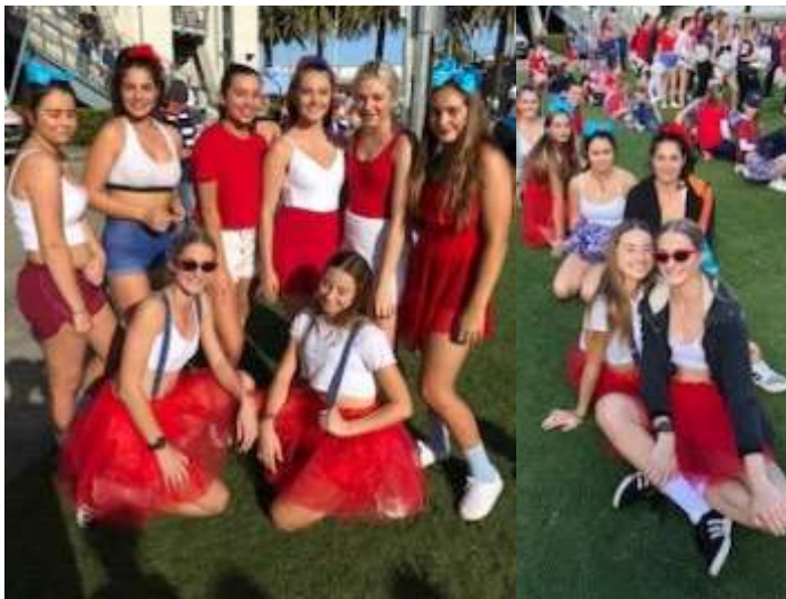
Our cheer girls at the recent Roosters NRL game.